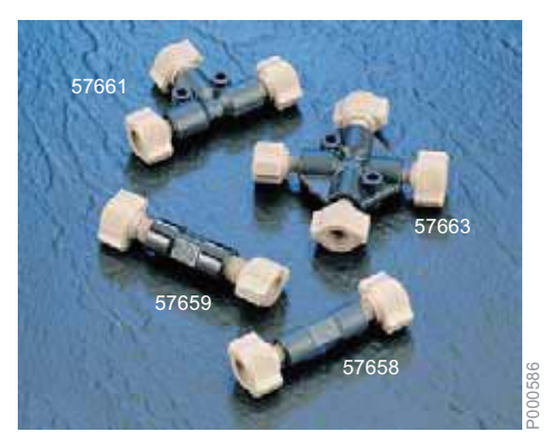
Upchurch PEEK Fingertight Unions

Operate the carbon-filled PEEK zero dead volume unions to 6000psi/420kg/cm<sup>2</sup>; 10,000psi/700kg/cm<sup>2</sup> when wrench-tighteneΦ000psi/352kg/cm<sup>2</sup>, the PEEK tees and crosses to 4000psi/281kg/ cm<sup>2</sup>. All items include Fingertight III nuts and ferrules.