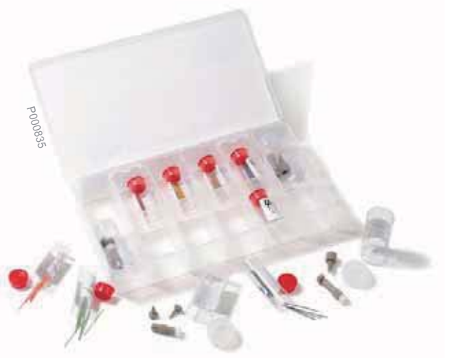
Upchurch Microtight Fittings Kit

10 Microtight tubing sleeves, 2 Microtight unions, 2 Microtight adapters.